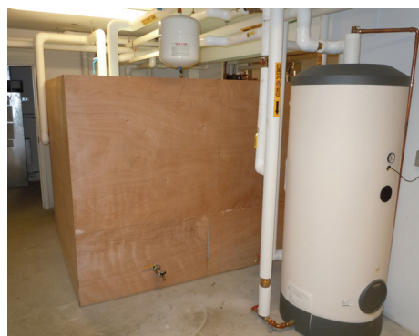
The mechanical room houses 1500 gallons of thermal mass storage in a site-built tank and a Stiebel Eltron SBB 400 Plus 108 gallon backup storage tank.

The DHW system is plumbed to recirculate once the temperature in the loop drops below a usable temperature. A 4-way valve regulates the recirculated water returning back into the DHW loop. A larger 3-way valve regulates water coming from the solar tank and the backup heater.