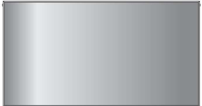
230017 - SOL 27 PREMIUM W