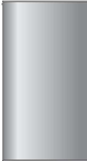
230016 - SOL 27 PREMIUM S

Available as standard vertical [ 230016 ] SOL 27 Premium S, and horizontal wide [ 230017 ] SOL 27 Premium W. Custom, versatile mounting rack kits are available.